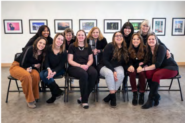
The Financial Aid Team of Colorado Mountain College

Weekly training, ongoing departmental messaging, and a mentoring buddy system have enabled the team to maintain a consistent level of quality in serving students.